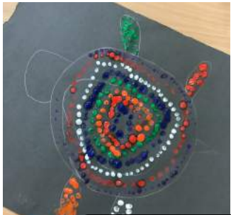
I choose three earthy colours to paint the tortoise and the paths- Dahlia