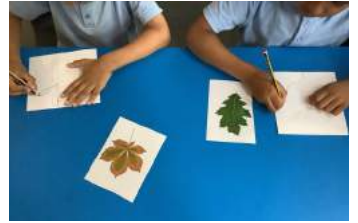
We had to be careful making the leaf template— Dua

Leaf printing - The children designed and created templates of leaves with great detail with bumpy / wavy / zigzag edges and veins. They used techniques such as to press, roll and stamp. Following the instructions was just as important too.