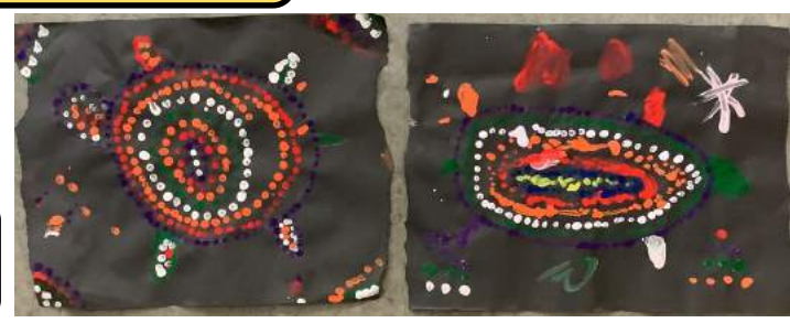
I imagined i was in the ocean swimming with the tortoises - Musa T