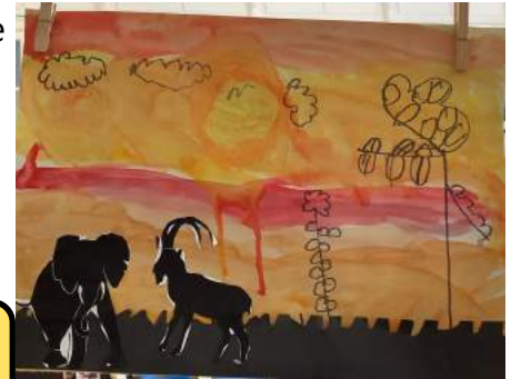
The sun is going down behind the African animals, it is setting - Ahsan

Aboriginal - For the children to understand the historical and cultural development of art forms they created their own aboriginal art of a tortoise.