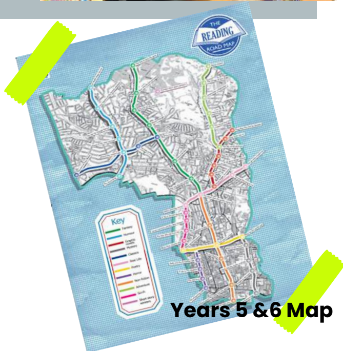
Years 5 & 6 Map