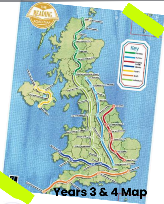
Years 3 & 4 Map