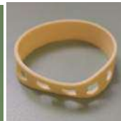
20 items - 50p each