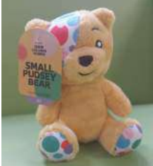
2 items - £5 each