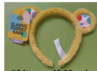
10 items - £2.50 each