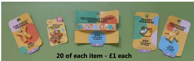
20 of each item - £1 each

We'll be selling these items on the day in the school office, number of items are limited. Cash only please!